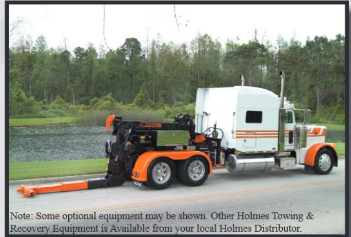
Note: Some optional equipment may be shown. Other Holmes Towing & Recovery Equipment is Available from your local Holmes Distributor.