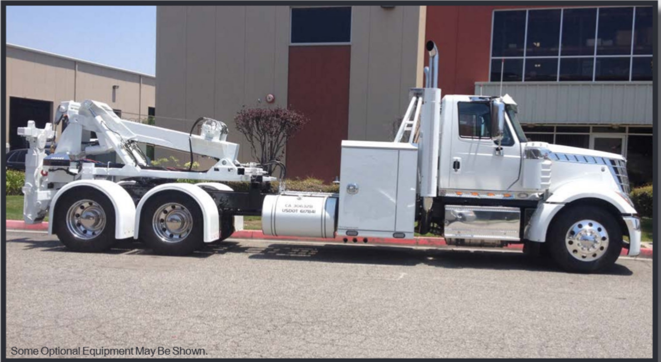
Some Optional Equipment May Be Shown.

The Holmes D.T.U. (Detachable Towing Unit) has been re-designed to decrease rear overhang, increase front axle weight, and offer better towability. With repositioned lift cylinders, the D.T.U. G2 also provides superior underlift height and further improved center of gravity and weight transfer. The unit comes standard with a 20,000 lb. planetary winch, 175' of 9/16" wire rope and front legs that allow the unit to be easily removed in a matter of minutes so your truck can be multi-functional for both towing and pulling trailers.